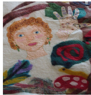
Mixed Media Banner, November 2010