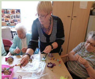
Making Textile Wrapped Jewellery.