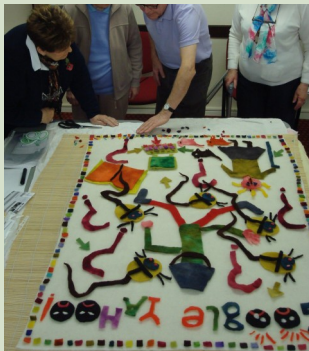
Creating a Felted Banner.