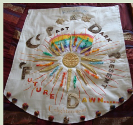
Visually impaired group . Mixed Media Banner, November 2010.