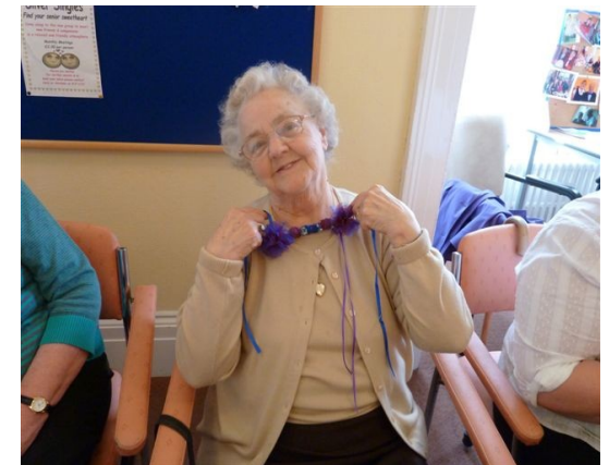
"Craft workshops are therapeutic"